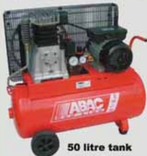
50 litre tank