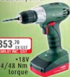
BS 18 L Cordless Drill/Driver

BATTERY PACK Electronic Single Cell Protection protects against discharging and overcharging