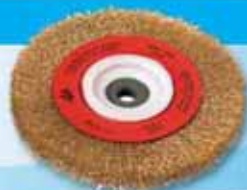
Bench Wheel Crimped