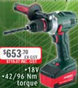
BS 18 LTX Cordless Drill/Driver, Impulse