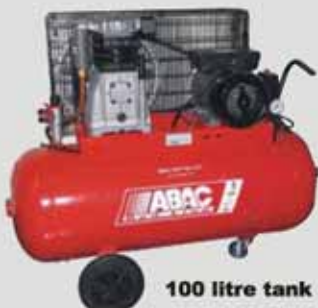
100 litre tank