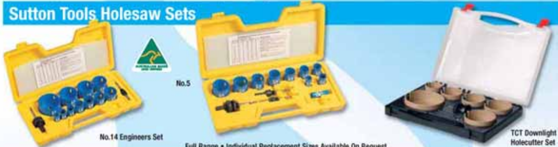
No.14 Engineers Set