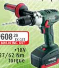
SB 18 LT Cordless Hammer Drill, Impulse