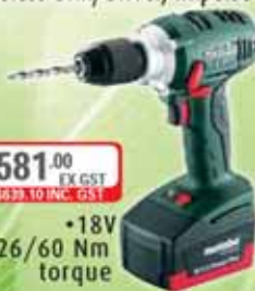
BS 18 LT Cordless Drill/Driver, Impulse