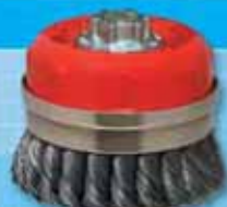
Brush Cup Crimped