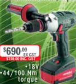
SB 18 LTX Cordless Hammer Drill, Impulse